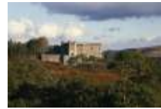
CASTLE DROGO & DARTMOOR