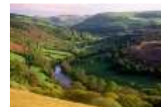
FOREST OF DEAN