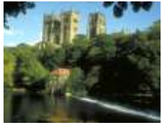
CITY OF DURHAM