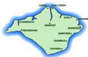
ISLE OF WIGHT