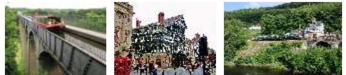
CANAL IN THE SKY