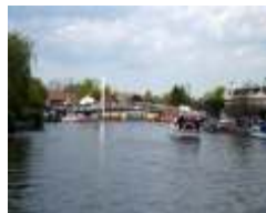
THE NORFOLK BROADS